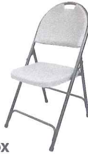
HDX Indoor/Outdoor Folding Chair (776776)