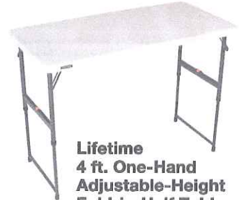
Lifetime 4 ft. One-Hand Adjustable-Height Fold-in-Half Table (1003262975)